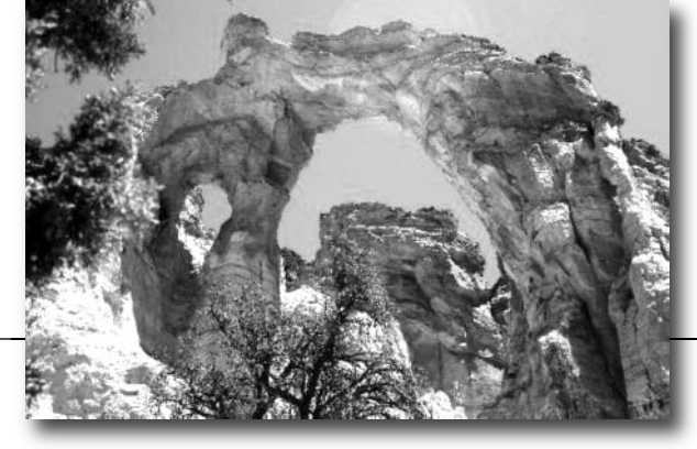
Grosvenor Double Arch, Grand Staircase Escalante National Park

Cost: ~$1200 plus airfare (~$500 from Bradley to Vegas)