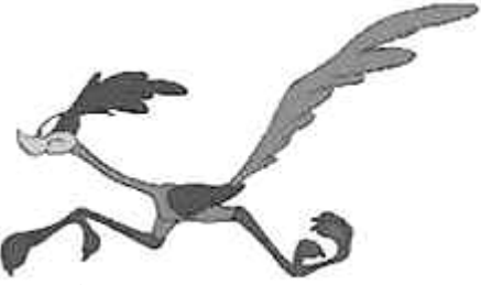
Roadrunner (Geococcvx californianus)

of seeing turtles, great blue herons, geese, ducks, red fox, deer, turkey, hawks, varied songbirds, and even bald eagles and otter. In 5 miles, we'll find ourselves on Lake Siog (also known as Holland Pond). After a stop for lunch, we will turn around and paddle from whence we came, going with the flow this time, and back to our cars. Total trip distance is about 11 miles. The current is negligible. The water is flat and paddling is generally easy. Novice paddlers are welcome, keeping in mind the distance we'll cover is a good challenge. Bring your boat, life jacket, lunch, drink, camera, binoculars, hat, sunscreen, and sense of adventure.